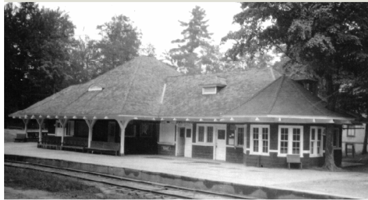
Sacandaga Station west-side in 1928

We are restoring the old Sacandaga Park Railroad Station and developing the surrounding 10 acres that are part of the former core of the Fonda-Johnstown-Gloversville ( FJ&G ) railroad property. We are doing this guided by the long-term goals of historic preservation and responsible economic development inside the Adirondack Park.