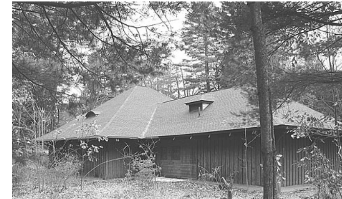
Sacandaga Station east-side in 2002